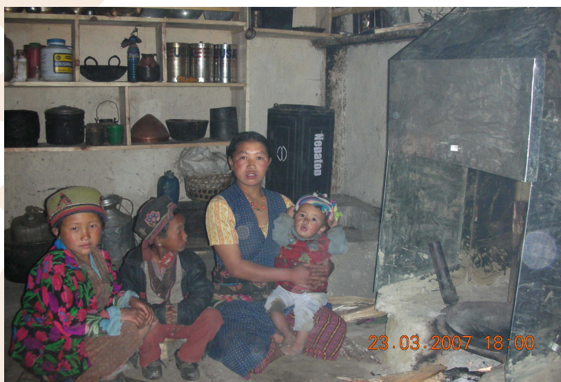
Women cooking - after the intervention

This policy brief is an output of a research project funded by SANDEE. The view's expressed here are not necessarily those of SANDEE's sponsors.