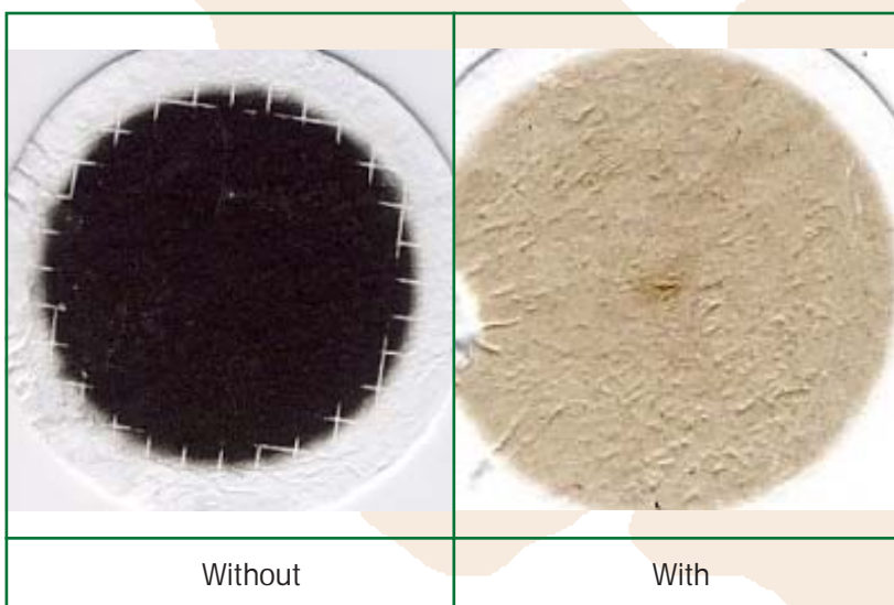
Figure 2: Particles deposited in smoke monitoring filters in with and without intervention households

A cost-benefit analysis was carried out to see whether it makes economic sense for people to install smoke hoods and carry out other anti-pollution interventions. To do this analysis, four benefits of implementing the interventions were highlighted and their economic values calculated. These benefits were: (i) health benefits; (ii) fuel savings; (iii) cooking time savings; and (iv) global environmental benefits due to greenhouse gas reductions.