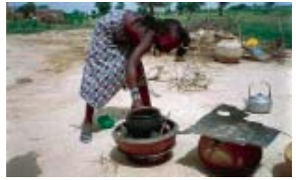
Preparation of Oryza longistaminata for food consumption, Mali

Customary laws, protocols and practices often define how traditional communities develop, hold and transmit TK. For example, certain sacred or secret TK may only be permitted to be disclosed to certain initiated individuals within an Indigenous community. Customary laws and practices may define custodial rights and obligations over TK, including obligations to guard it against misuse or improper disclosure; they may determine how TK is to be used, how benefits should be shared, and how disputes are to be settled, as well as many other aspects of the preservation, use and exercise of knowledge.