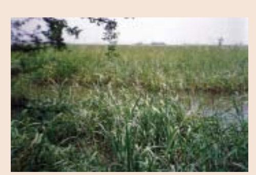
Oryza longistaminata grows in the marshes and river banks of Mali.

concerning conservation, sustainable use and equitable benefit-sharing of genetic resources. In general, the preservation and protection against loss and degradation of TK should work hand-in-hand with the protection of TK against misuse and misappropriation. So when TK is recorded or documented with a view to preserving it for future generations, care needs to be taken to ensure that this act of preservation doesn't inadvertently facilitate the misappropriation or illegitimate use of the knowledge.