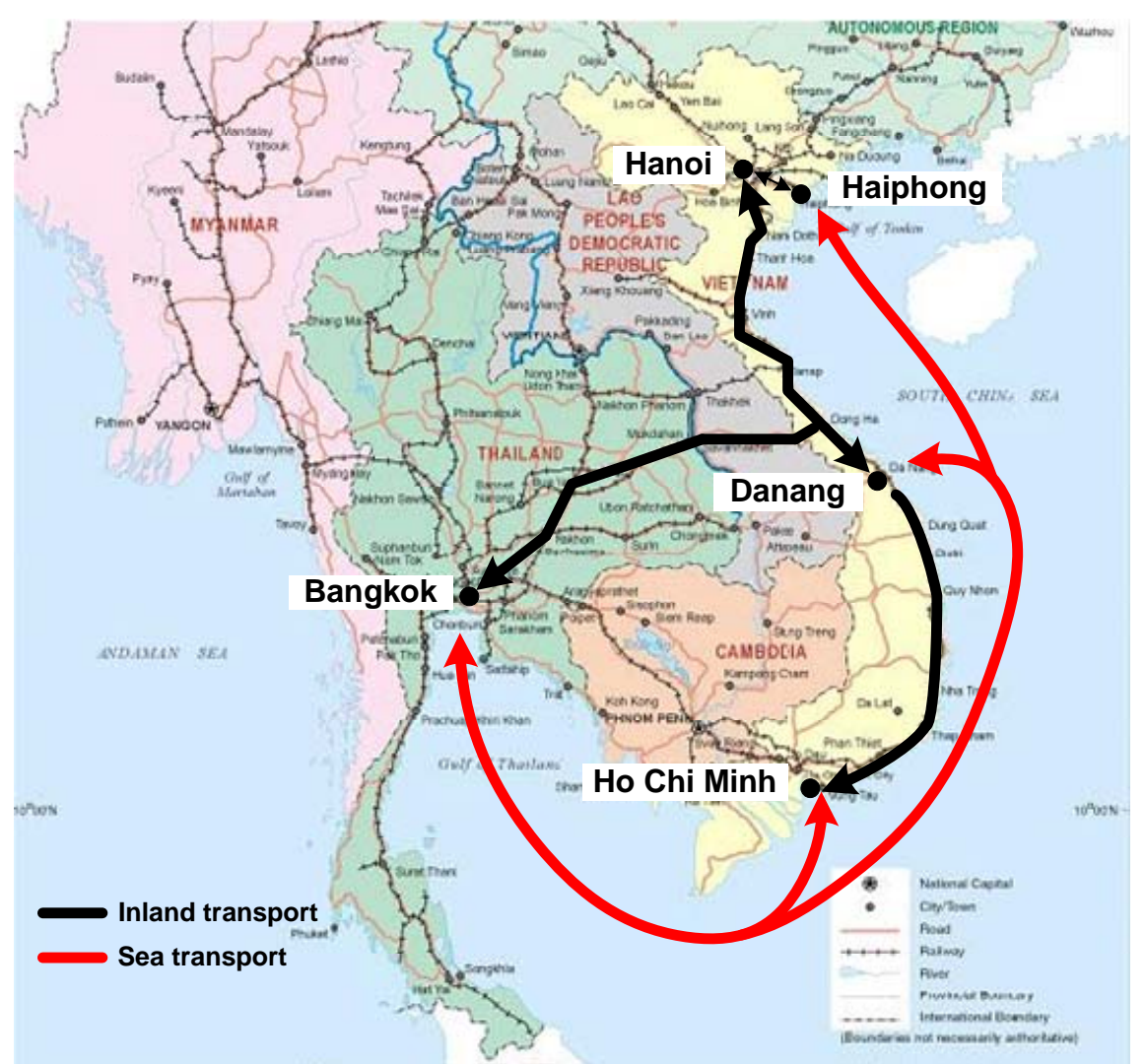
Figure 2: Supply Chain Routing Alternatives between Thailand and Viet Nam