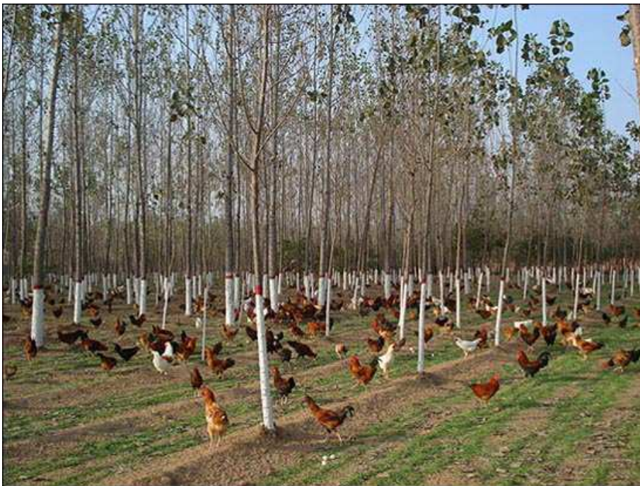
* Integration of poplar wheat-based and poultry in agro-forestry. Siyang County, China.

On the whole, in order to achieve a comprehensive, human centred and sustainable land governance, Chinese people need to continue to develop innovative ideas and technologies, reform institutions, and adjust lifestyles, so as to attune toward environmentally friendly and sustainable methods. It is encouraging that China is