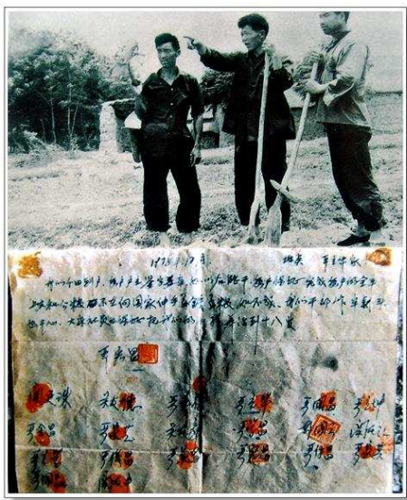
Picture 1: In 1978, hungry villagers from Xiaogang village, Anhui Province, China, began their way of 'household responsibility system'.

In the early 1980s, the household responsibility system (HRS) was widely adopted as a replacement for the previous system of the people's commune. HRS was first created by a group of devastated hungry peasants (see Photo 1) but spread nationwide with the support of the central government; by 1983 more than 93% of production teams had adopted the system. Under HRS, households were allowed to lease land, and hire machinery and other facilities from collective organisations. 6 In other words, farmland remained owned by village collectives, but the collectives offered leases and contracts to individual households. Individual households could take independent operating decisions within the limits of their lease or contract. After paying a fixed amount to the government, they could freely dispose of surplus production to the market.