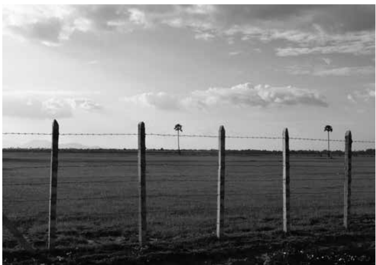
Land enclosure for Special Economic Zone in Cambodia

States enable these enclosures by enacting policies, laws, and regulations that favor markets and by using their legal and security apparatus to suppress and punish those who resist. International financial institutions (IFIs), multilateral agencies, international policy institutions, transnational corporations, and even some civil society organisations have sought to re-frame and re-present land, water, and resource grabbing as "win-win" investments whereby investors can secure