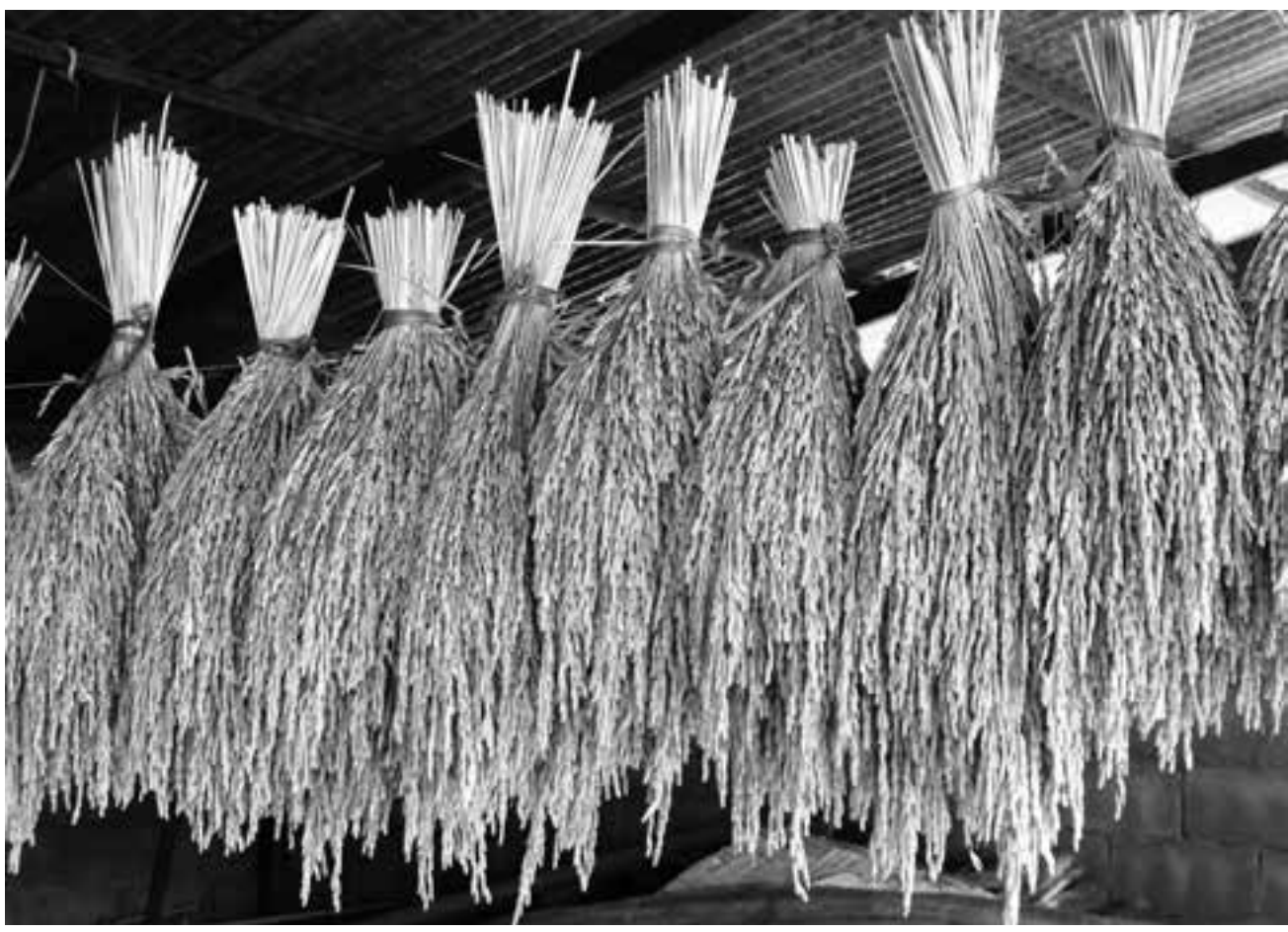
Saving traditional rice seeds in Laos