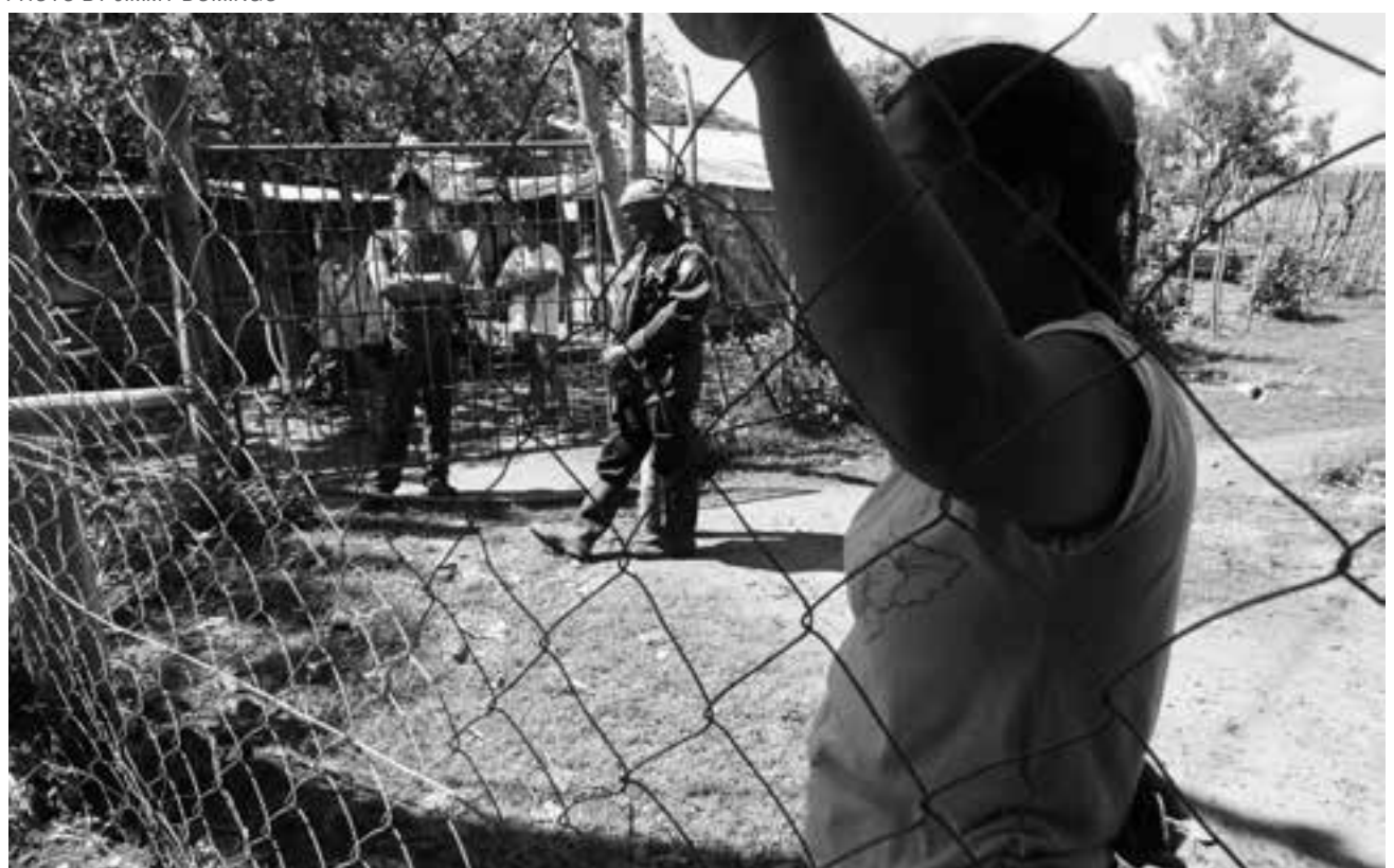
Fenced in/fenced out. Farmers and residents in the village of Sumalo, Hermosa, Bataan endure modern-day enclosures as they contest the ownership of 214 hectares of agricultural lands vs a real estate company