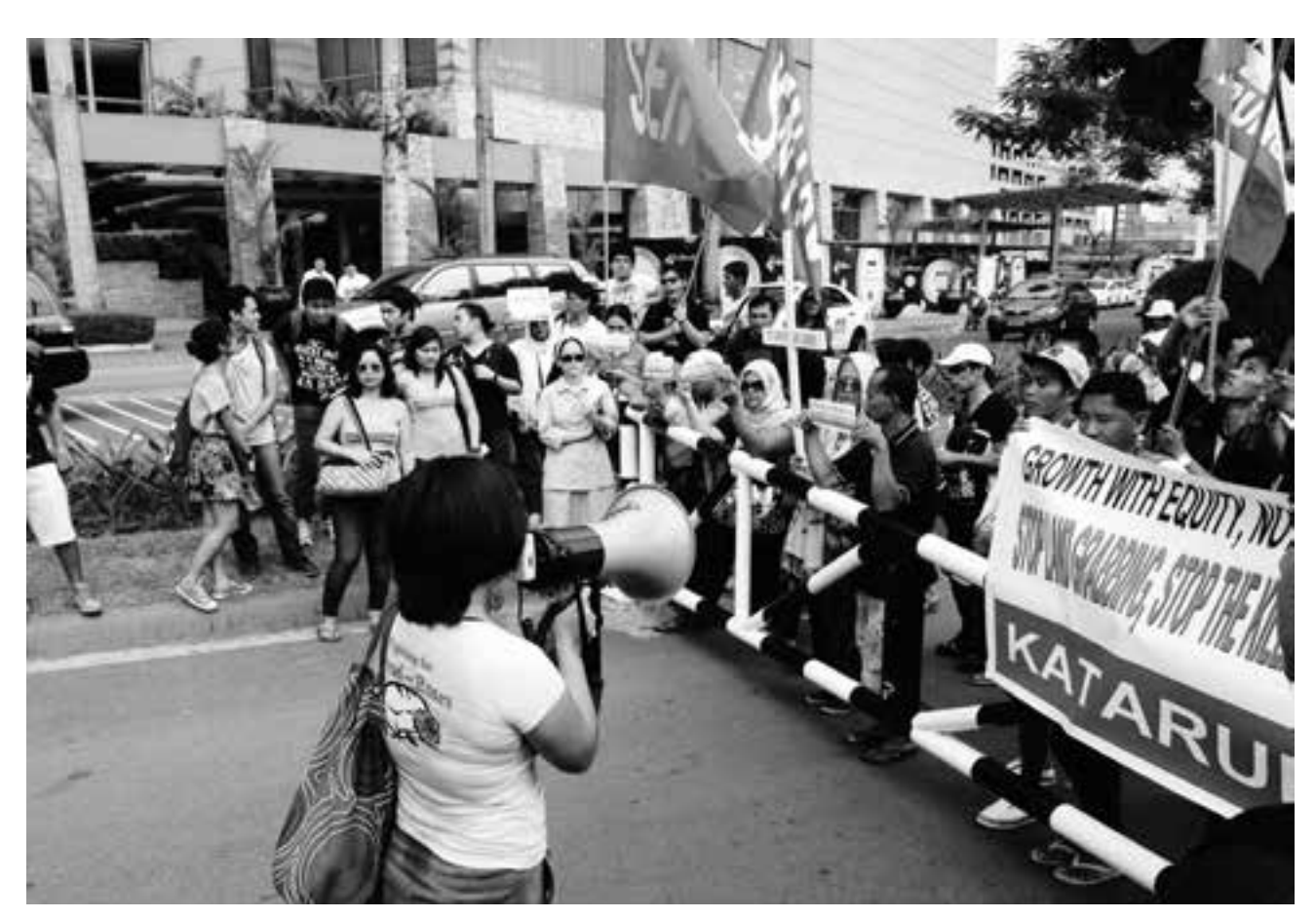
Farmers and activists protest the land grabbing of their agricultural lands by one of the biggest conglomerates in the country

(NEDA) and renamed the Public-Private-Partnership Center and again in October 2012 when the PPPs IRR was amended resulting in changes in specific incentives for project proponents and aimed at improving transparency. Currently, additional amendments to the BOT Law are being proposed for passage by the Senate and Congress