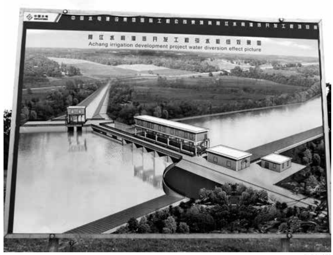
Plan for a water diversion and commercial irrigation project in Cambodia

Maastricht Principles on Extraterritorial Obligations (ETOs) of States in the Area of Economic, Socio-Cultural Rights (ESCRs). This was adopted by international jurists, law and human rights experts, and UN special rapporteurs, etc. Based on legal research for more than 10 years, the Maastricht Principles is an attempt to make states accept that they have human rights obligations including access to land and natural resources beyond their national borders, thus, extraterritiorial obligations. The realization of ETOs can create an enabling environment for the protection, promotion, and fulfillment of ESCRs and guarantee the primacy of human rights among competing sources of international law. It also provides regulation of TNCs and holds inter-governmental organizations such as the European Union and the Association of Southeast Asian Nations, among others, accountable for impacts. However, it is not legally binding.