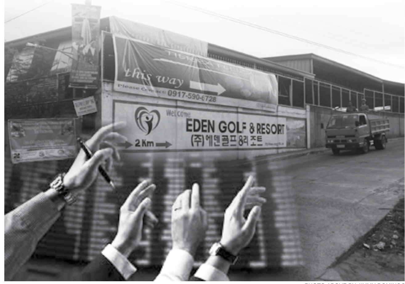
Land speculation and land use conversion for non-agricultural purposes

more involvement of financial actors in the agricultural sector for its so-called 'stable investment opportunities'. Financial actors have started investing in land, commodities, derivatives, and companies as response to volatility in financial markets. Actors within the financial sector explain their interest in agriculture as primarily due to the 'current prospects for income generation, capital appreciation, and uncorrelated returns with equity markets, and as a hedge against inflation'.5 Financiers also tell the public that 'food security' is a primary driver for their interest. To paraphrase, by injecting capital into agricultural land they can help meet the new diets of the world's growing population. As one investor has explained it, "By 2050, it is projected that the population will grow to about 9.2 billion, close to 30 percent increase from the current population of 6.5 billion. Along with the rise of the middle-class in mega-countries like China and India, food prices can only go one way-up. According to a New York Times article, scorching heat, and the worst droughts in nearly half a century will threaten to send food prices up in 2013. Prices for beef is likely to rise 4-5 percent. Keeping this in mind, there isn't a more apt time to invest."6