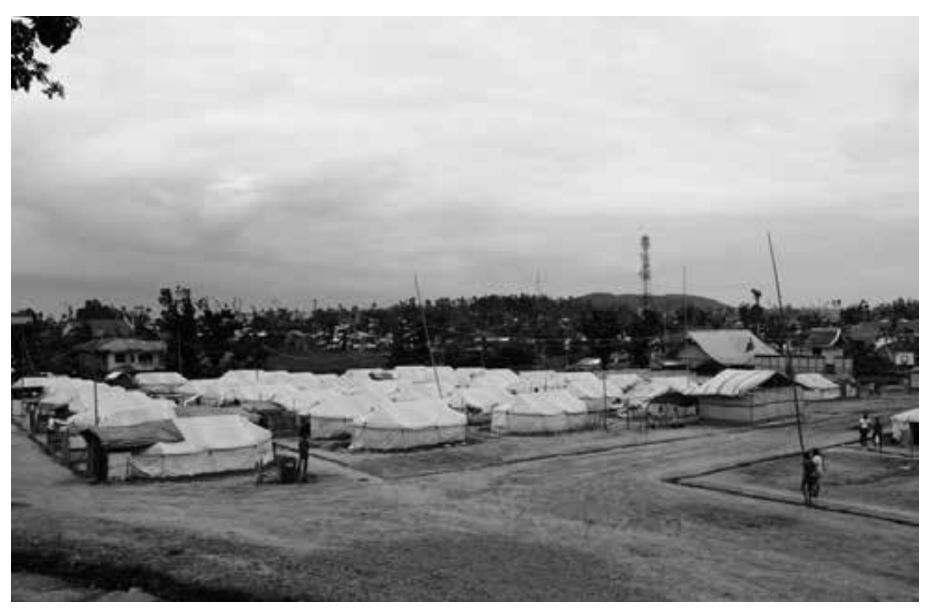
Thousands of Yolanda/Haiyan survivors lived in a tent city for more than three months in Estancia, Iloilo