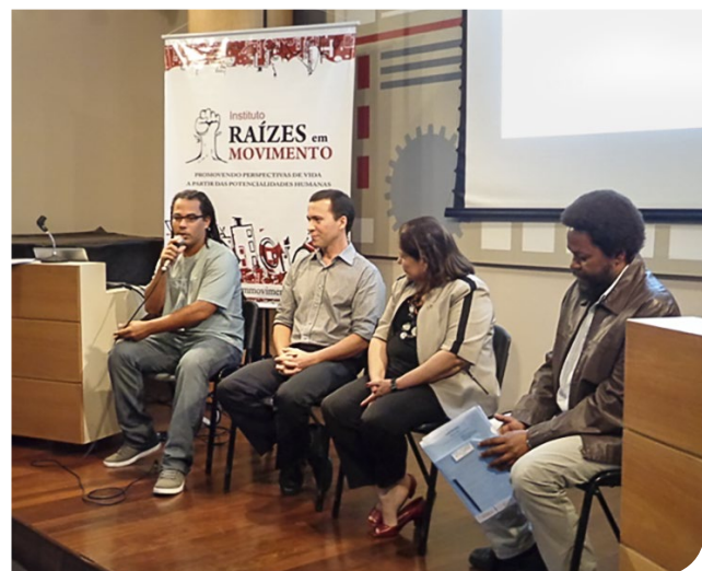
ATD FOURTH WORLD 2013

Most of the processes involved a final day in which the findings were relayed to and discussed with policymakers.