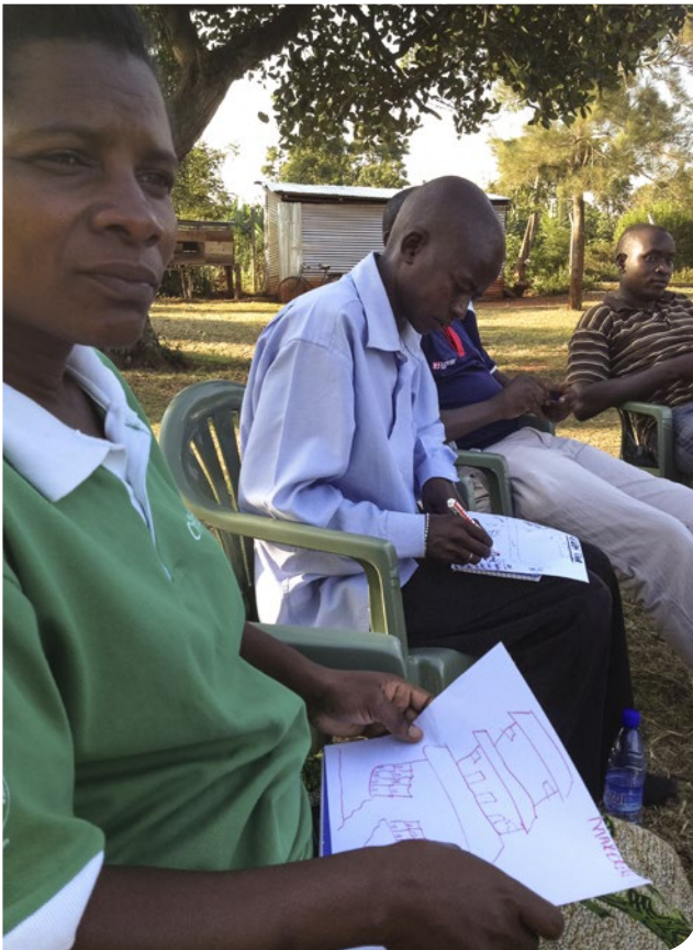
GROUND LEVEL PANEL UGANDA; RESTLESS DEVELOPMENT UGANDA 2013