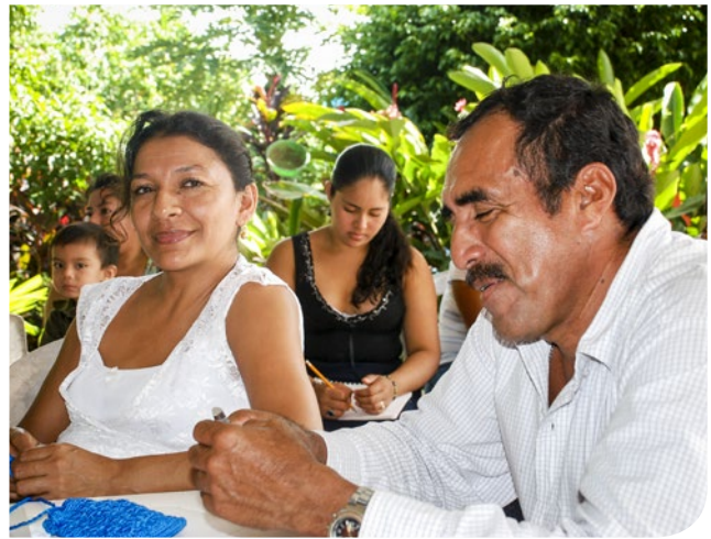
UNIVERSIDAD AUTÓNOMA METROPOLITANA, XOCHIMILCO 2013

Having inclusive laws and policies in place that protect the rights of all people is critical for achieving social justice. LGBTQI activists in the Balkans are engaging in advocacy to ensure equality in law, in terms of non-discrimination and family rights. For transgender persons in India the provision of laws for sexual minorities is seen as an important mechanism for government to help end discrimination. The scope of recognised rights and the degree to which people can claim and exercise those rights shifts in response to changing power dynamics; what is critical is that where these rights are accepted, they are made real in people's lives (Miller et al. 2005a).