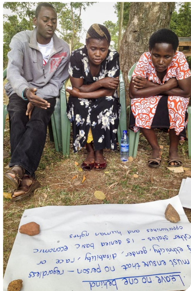
RESTLESS DEVELOPMENT UGANDA 2013

Many deliberative processes are open to the public to watch. In this case of the Ground Level Panels, we felt that