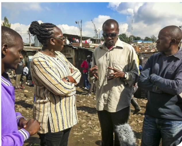
SPATIAL COLLECTIVE 2013