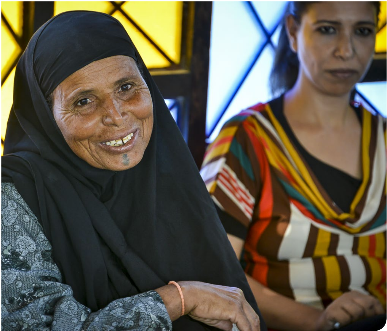
GROUND LEVEL PANEL EGYPT/CDS 2013

The GLPs were dialogic processes that started with people's life stories – their realities. The GLPs recognised that the issues that are discussed are fundamentally political issues that cannot be disguised as neutral 'technical' questions. Ultimately, decisions about development reflect different values and assumptions. If our starting assumption is that development should bring the largest possible number of people out of poverty, then the actions that follow will be quite different from a starting position with the aim of eliminating extreme poverty. This means that it is crucial that deliberative processes debate the underlying assumptions about poverty, not just make choices between positions that have been pre-constructed by others.