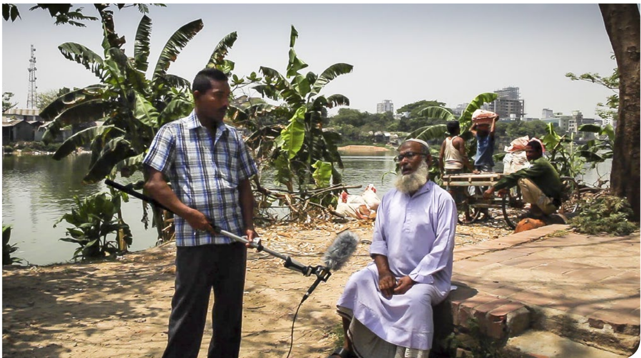
WE CAN ALSO MAKE A CHANGE 2013

We want to give two to three per cent to disabled organisations. The situation is changing. The chairman of this particular area... is saying that disabled people should be treated on a priority basis – as the chairman is himself sensitised. They have a budget for persons with