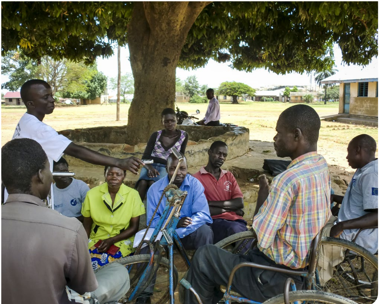
COMPASS 2015, 2013

The work in the Philippines engaged subsistence fishermen, farmers, informal labourers and forest dwellers, persons with disabilities (PWD), children, young people, older people and women, indigenous peoples (the Moro) – those who were internally displaced by disasters, informal settlers and ex-combatants. Research was coordinated by Ecosystems Work for Essential Benefits (EcoWEB) across 13 communities in Mindanao, an area confronted with challenges relevant to sustainable development, peaceful coexistence among its inhabitants, and accountable governance. This in-depth participatory research project was part of the COMPASS 2015 endeavour of the Catholic Agency for Overseas Development (CAFOD) to ensure that the perspectives of those living in poverty are included in the process of crafting the post-2015 framework.