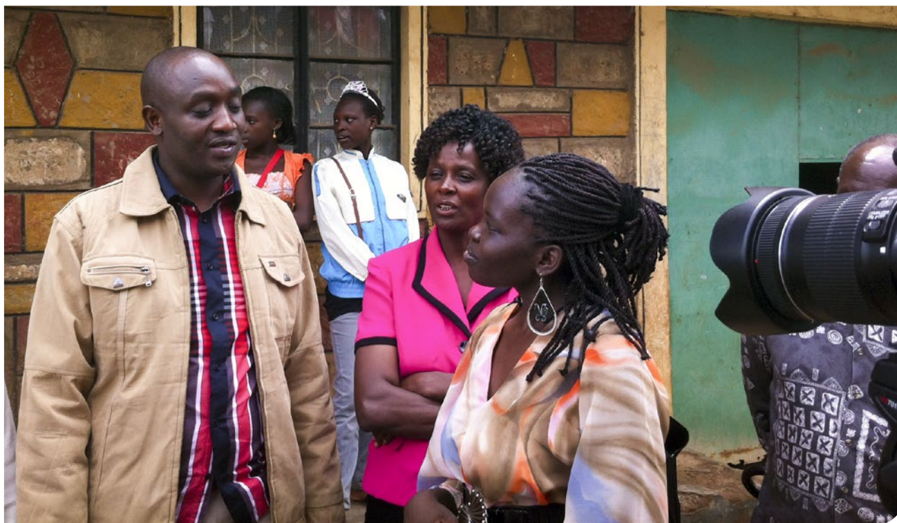
SPATIAL COLLECTIVE 2013

This case study shows how processes of accountability and collective action should not assume democratic citizen identity as the starting point for citizen accountability. What the Participate research shows is that democratic and inclusive relationships between people, in family structures and communities, play an important role in fostering the experience of citizenship for people living in poverty and marginalisation. The transformation of these relationships and the creation of spaces for expressing citizenship with others support people to recognise their rights. To engender accountability for excluded people living in poverty and marginalisation strategies need to be grounded in processes of empowerment that are both an individual personal process and a collective, political one. This is the part of the iceberg that is under the water.