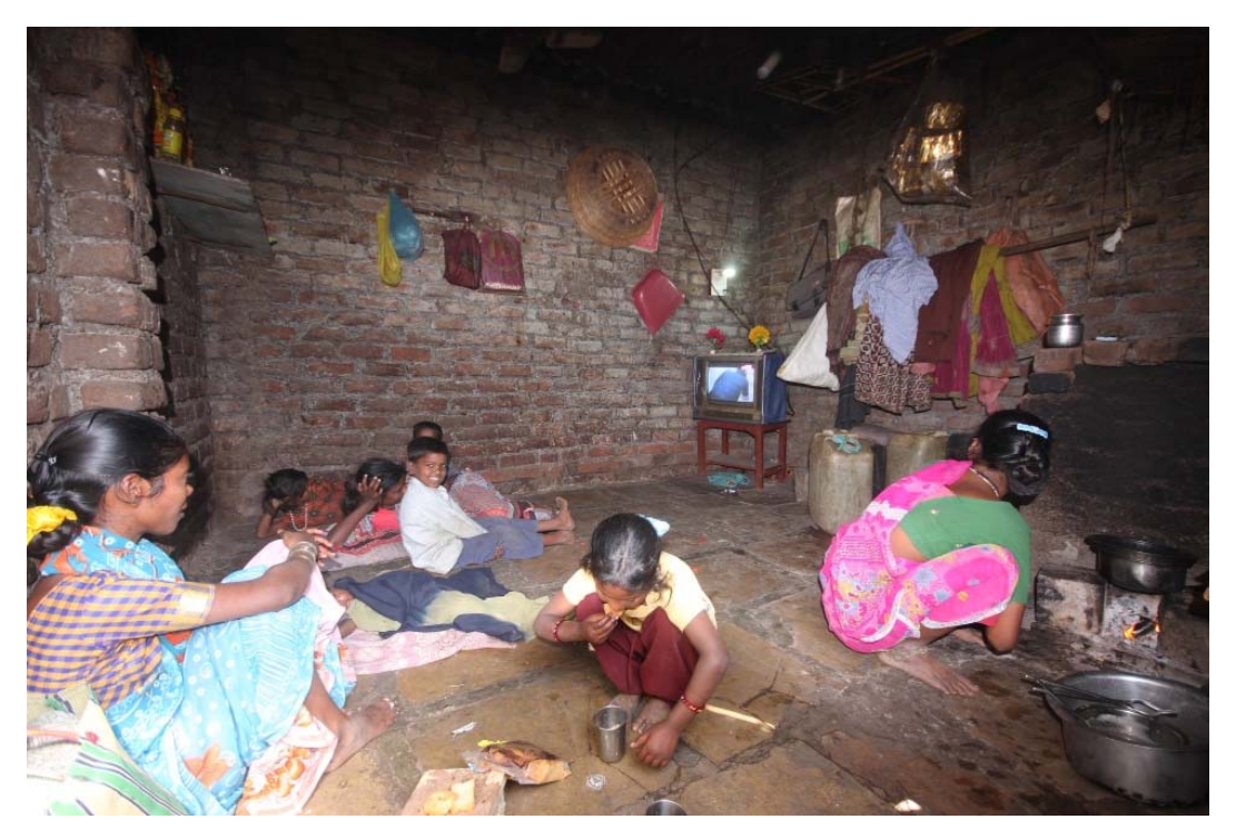
Annexure VI-4: The inside of a Pardhi home in the Mankhurd Transit Camp