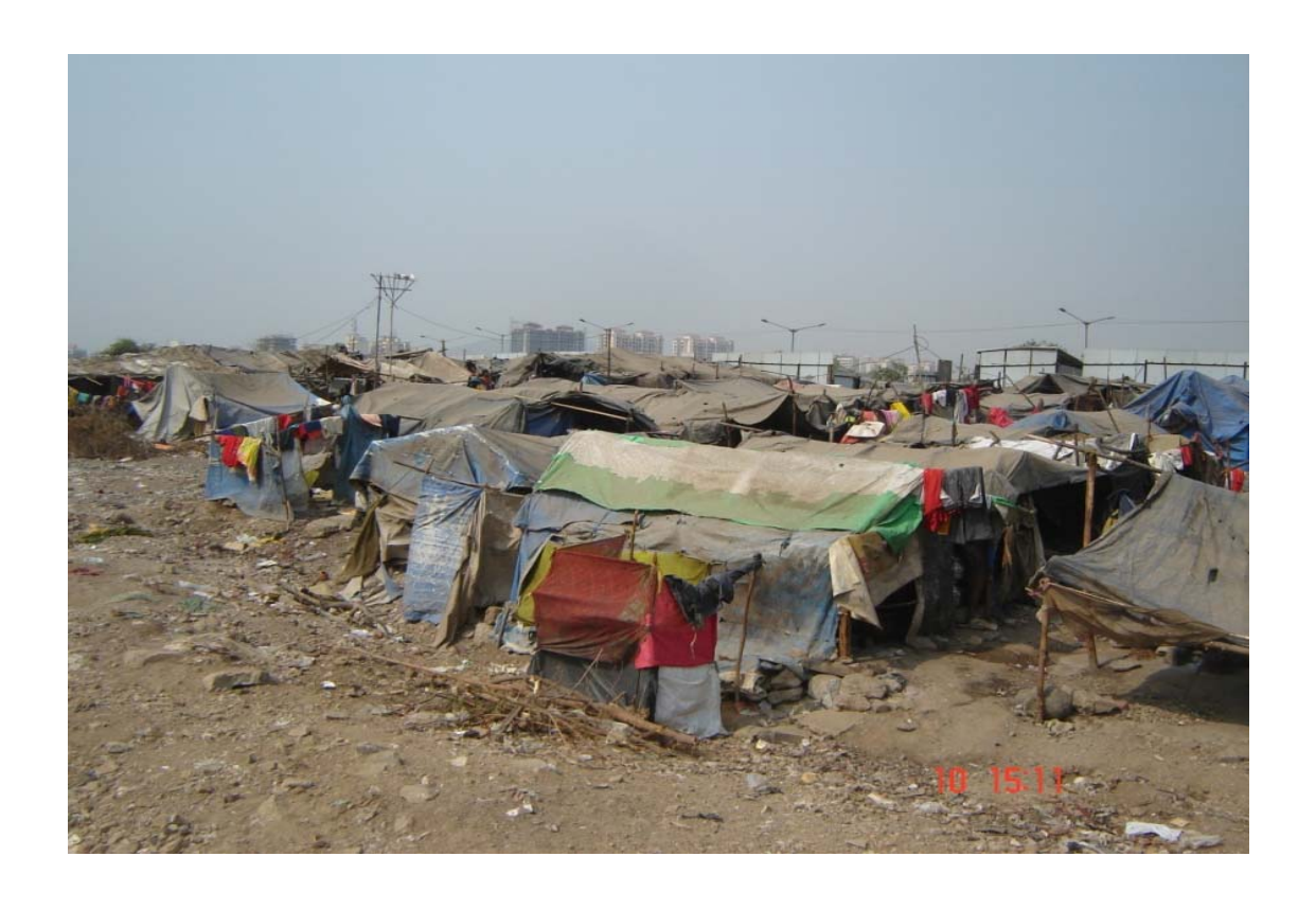
Annexure VI-6: Aftermath of slum demolition of Jai Ambe Nagar settlement in 2009