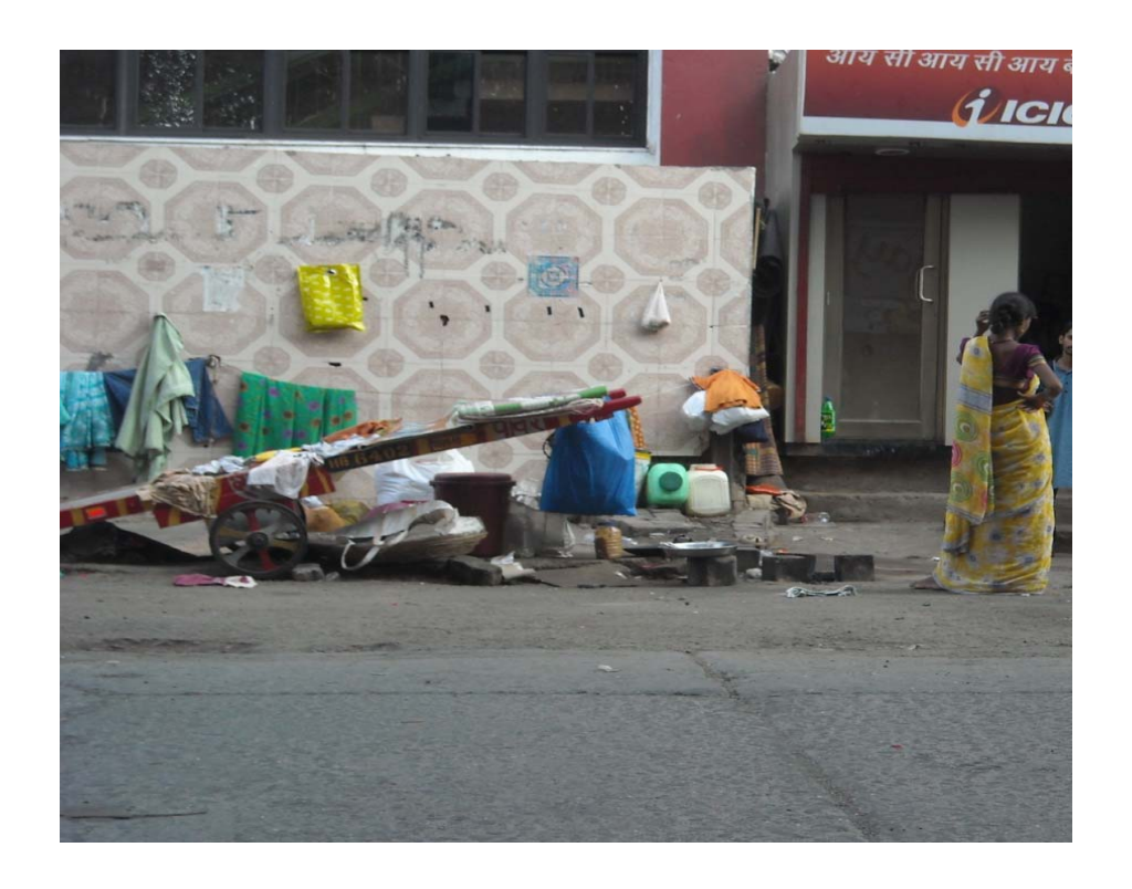
Annexure VI-2: The Appapada Pardhi enclave on the small hill adjoining Sanjay Gandhi National Park