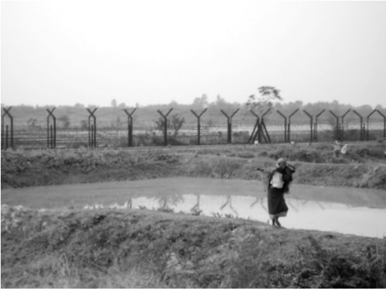
Woman seen fetching water from a pond near the fencing