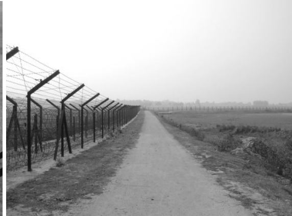
Fencing under construction and a border road along with fencing in West Garo hills