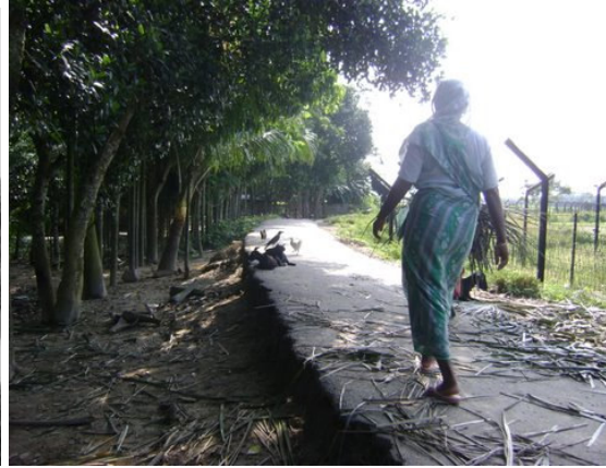
A mother passing by fencing where her son was killed by BSF in West Garo hills