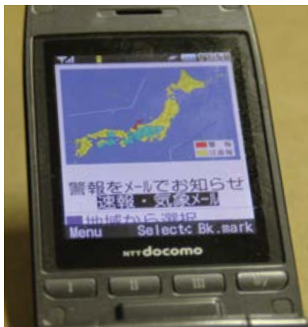
Earthquake alert on mobile phone, November 2012.

A survey by the Japan Commercial Broadcasters Association showed that, respectively, wireless public address systems, radio and television broadcasts and word of mouth were the most useful channels