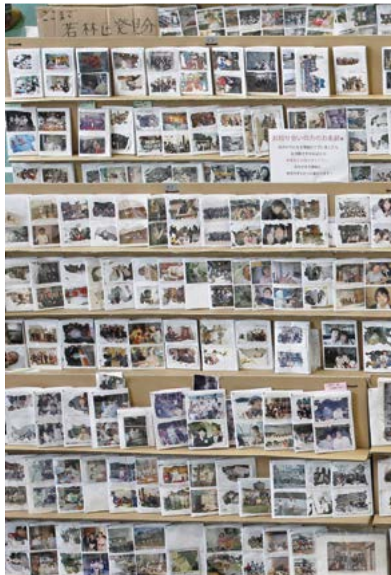
A man looks for his photographs at a collection centre for items which were found in the rubble of an area devastated by the March 11, 2011 earthquake and tsunami in Sendai, Miyagi prefecture March 9, 2012, ahead of the one-year anniversary of March 11, 2011, earthquake and tsunami. More than 250,000 photographs and personal belongings are displayed at the centre for owners to recover.

Shortly after the tsunami, the Japanese government began producing regular situation updates in Japanese, but little humanitarian information was