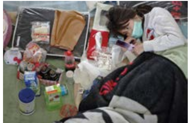
A woman looks at her mobile phone as she rests at an evacuation centre for people affected by the March 11 earthquake and tsunami in Ishinomaki, northern Japan April 3, 2011. Japanese engineers grappling on Sunday to control the world's worst nuclear crisis since Chernobyl tried to seal a crack leaking radiation into the Pacific sea from a crippled reactor.

While a number of projects were set up by the academics, researchers and developers, two projects, namely Project Hayano and Mass Media Coverage Map should not be ignored. Project Hayano 118 aims to understand the risk of thyroid cancer among children in Fukushima and nearby areas through data visualization and simulation. By combining different data sets provided by the 311 Project and other released data from SPEEDI and JAMSTEC,