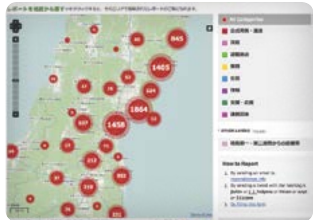
Screenshot of the sinsai.info disaster map. In English the motto below says the map was created by everyone, similar to open source.

Following on from the Haiti earthquake of 2010, the volunteer technical community raced to map messages from the disaster zone. And within four hours of the earthquake, Japan's version of the Ushahidi crisis map, sinsai.info , meaning "disaster info", had also been created. 99