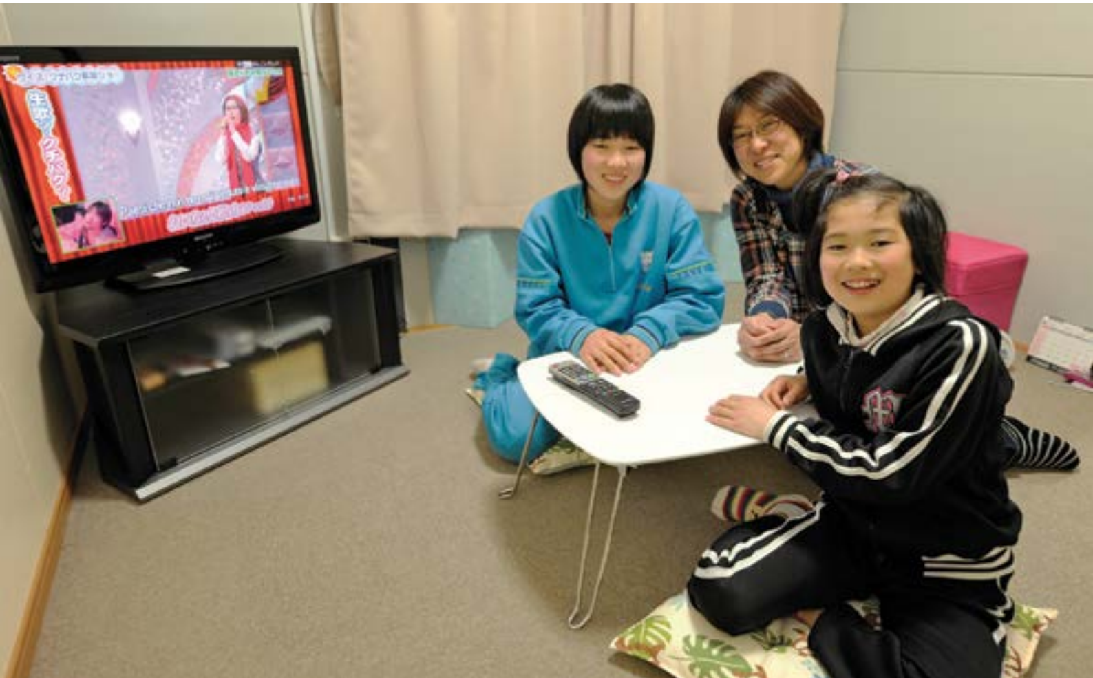
Vital donations: televisions carried safety messages and entertained in evacuation centres.