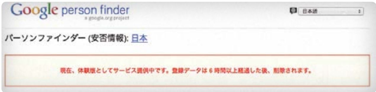
Screenshot of Google Person Finder's website

in the Philippines in August 2012. 90 Within hours of the 7.3 magnitude earthquake that struck Japan on December 7, 2012, Twitter Japan recommended hash tags for those wanting to follow news or discuss that earthquake. 91