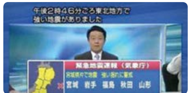
Japan's public broadcaster NHK announces an earthquake in the Tohoku region on March 11, 2011.

On March 11, 2011, the JMA detected powerful seismic tremors and sent an automatic earthquake