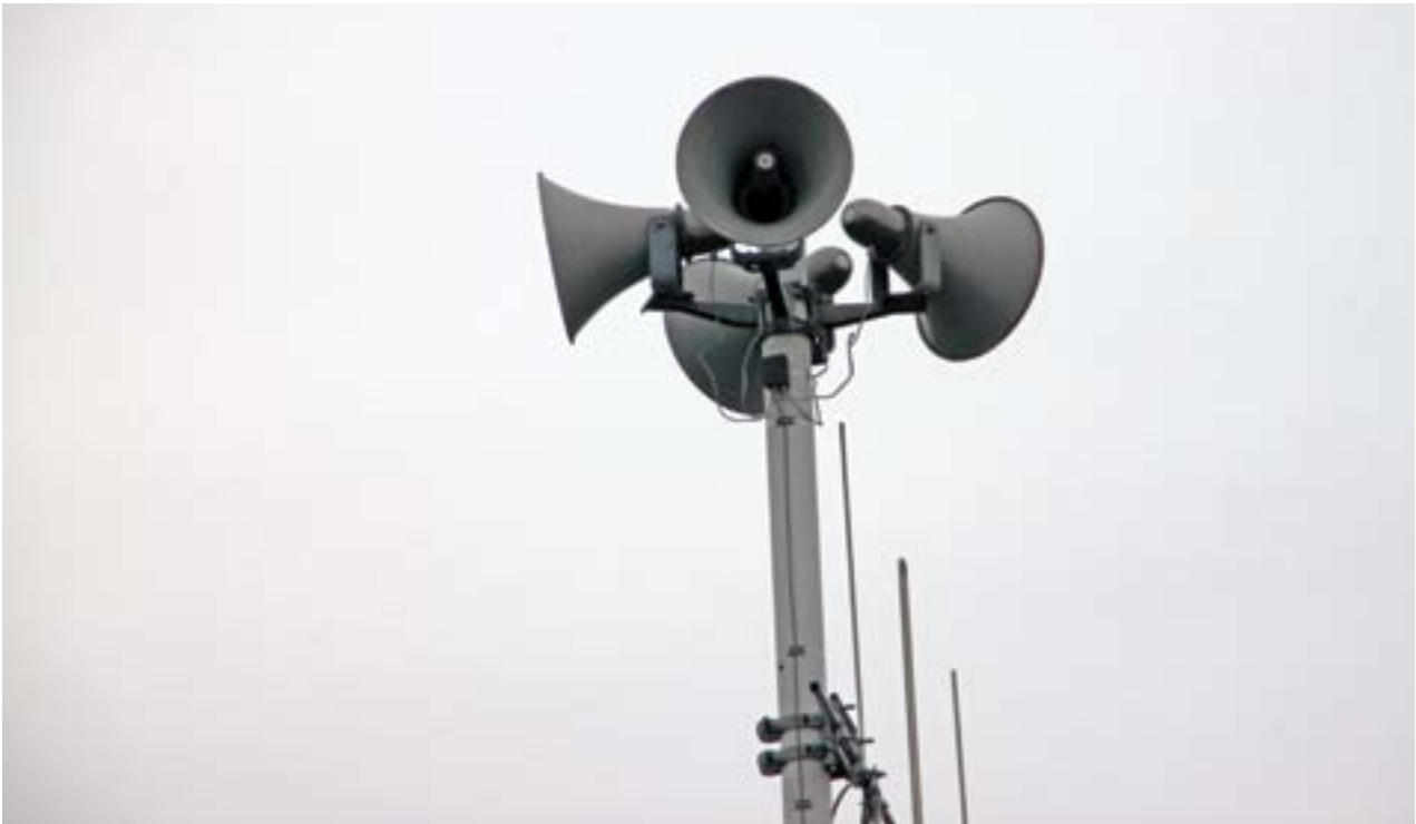
Wireless Community Speakers, November 2012 LOIS APPLEBY

A smartphone application such as Yurekuru Call, meaning “Earthquake Coming”, can also be downloaded and it will send warnings before an earthquake, details of potential magnitude and arrival times depending on the location. 37