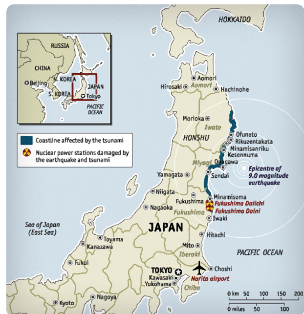
Location of earthquake, tsunami and affected nuclear power plants.

However, having invested billions of dollars in earthquake resiliency measures since 1995's Great Hanshin-Awaji or Kobe earthquake, which killed over 6,000 people, Japan is also considered a world leader in disaster preparedness. 18