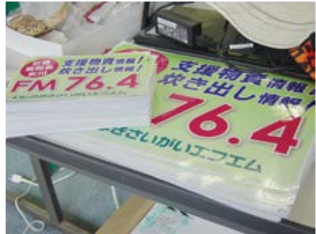
Ishinomaki Saigai FM Station signs, Ishinomaki, November 2012. LOIS APPLEBY

tsunami hit the area, elderly locals had both physical and psychological difficulties with evacuation. 24