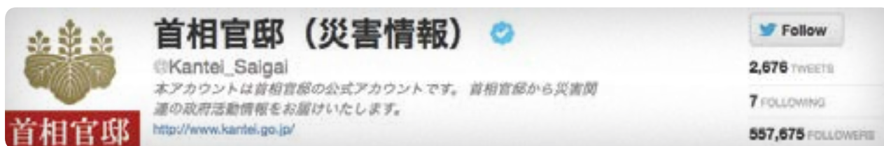
A screenshot of the Japanese PM's Office's Twitter account in 2012

In response to the grass-roots movement to create disaster-specific hash tags, Twitter Japan (@twj) sent a tweet summarising the most popular hash tags on March 12. Later they also published a blog that outlined the most used hash tags for different purposes and contained links to official disaster information sources. 70 The most popular hash tags included: #anpi (for finding people) and #hinan (for evacuation centre information) as well as #jishin (earthquake information).