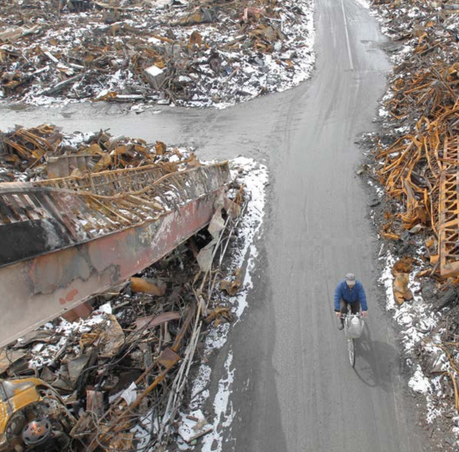
A man rides a bicycle at an area hit by earthquake and tsunami in Kesenuma, north Japan, March 17, 2011.

The country also has a high internet and mobile penetration rate; statistics show that 80 percent of the population are internet users with around 84 percent using mobile phones. 20 However, Japan also has the world's most rapidly ageing population, with 24 percent over 65 years old. 21