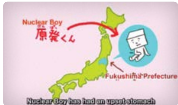
Screenshot of Nuclear Boy, animated cartoon explaining the Fukushima nuclear disaster

YouTube also served as a channel for requesting assistance. The most notable appeal came from within the Fukushima evacuation zone, where the mayor of Minami-Soma city made a desperate plea for volunteers and relief supplies. The video had almost half a million views. 82 According to the newspaper, The Japan Times, the video resulted in truckloads of relief supplies and international media coverage and prompted apologetic phone calls from government officials and TEPCO. 83