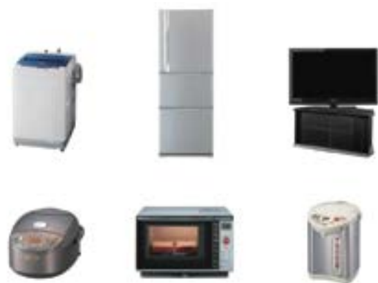
The sets of essential electrical items donated by Japan Red Cross after the disaster.

Although television's dominance was usurped by local radio during the disaster, afterwards it became one of the main sources of information again. In the communities most affected by the disaster, many people found themselves living in evacuation centres set up in schools, community centres and sports halls for up five months. Once generators were provided and conditions in the evacuation centres stabilised, private companies, NGOs and individuals donated televisions and radios.