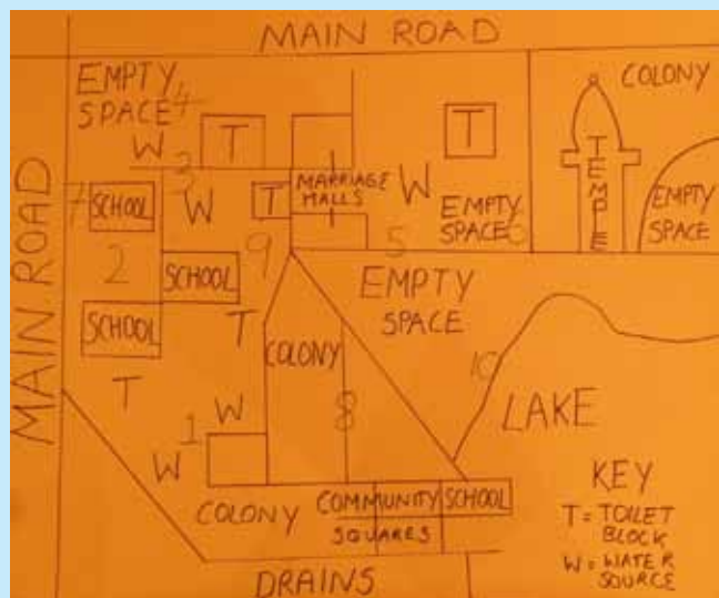
Source: Translated copy of map produced by women from Bhalswa slum

The community toilet blocks were not mentioned as dangerous in themselves by this particular group of women but the routes to the toilet blocks were associated with sexual violence.