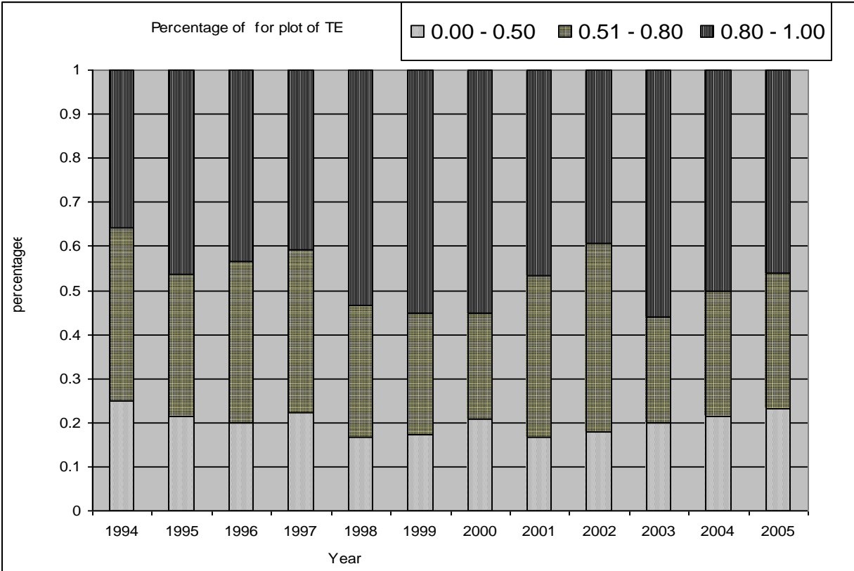
Figure 2. Percentage of firms belonging to different technical efficiency bands